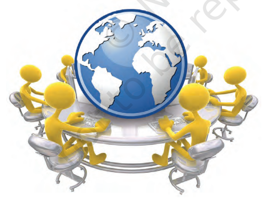
Fig. 7.1: Cyber World