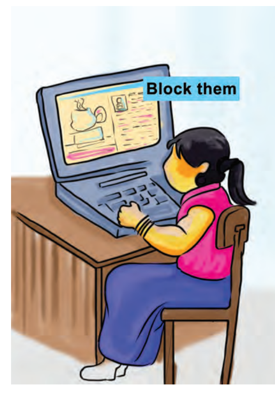
Fig. 7.5: Block