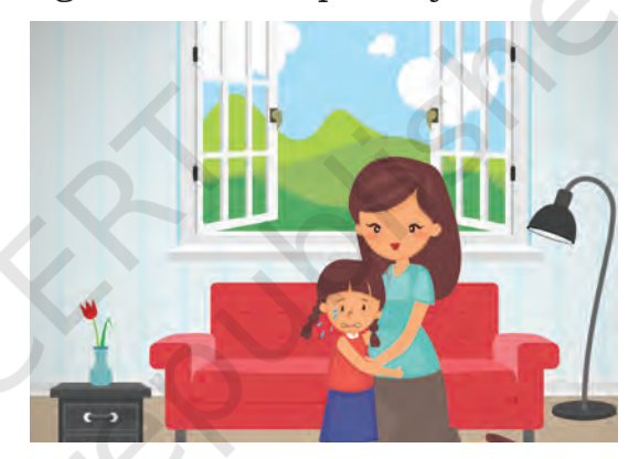
Fig. 7.6: Talk about it

Cyber bullying may affect you in many different ways. Dont feel that you are alone. Let your parents and teachers know what is going on. Never keep it to yourself.